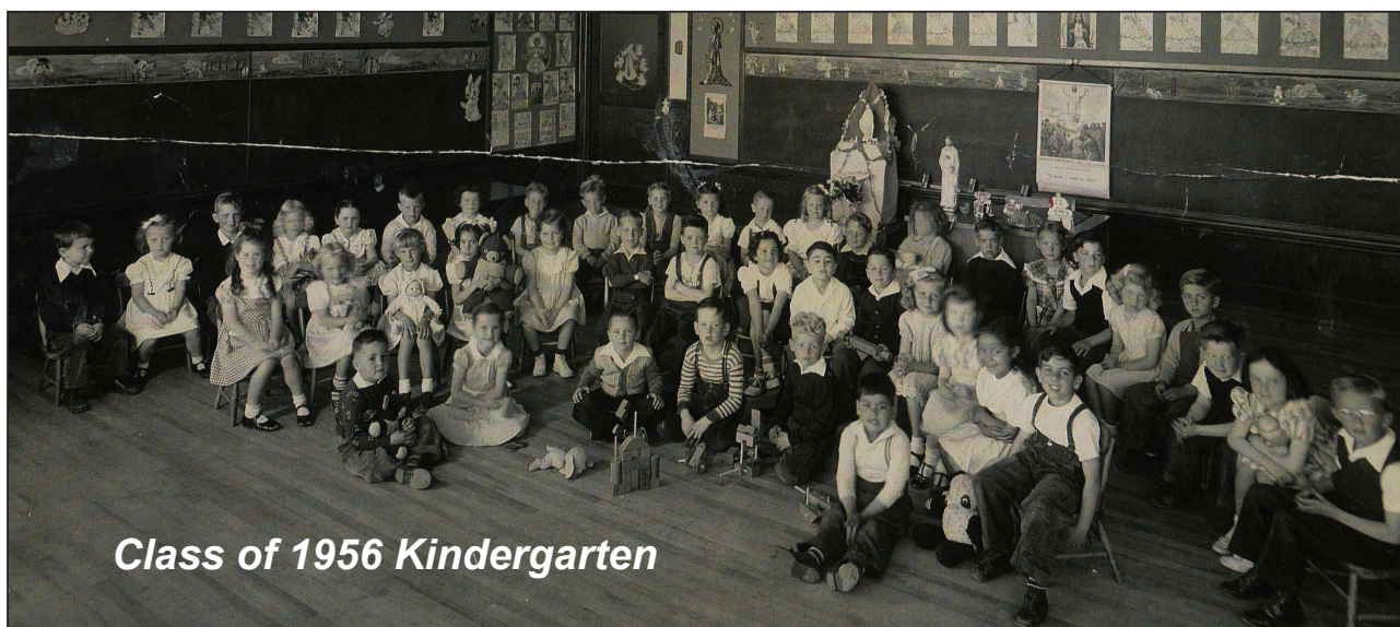
Class of 1956 Kindergarten

A highlight at this years Alumni Auction event was the awarding of Diamond Diplomas to the class of 1956.