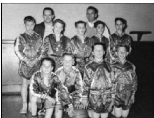
1957 "90's" BASKETBALL TEAM